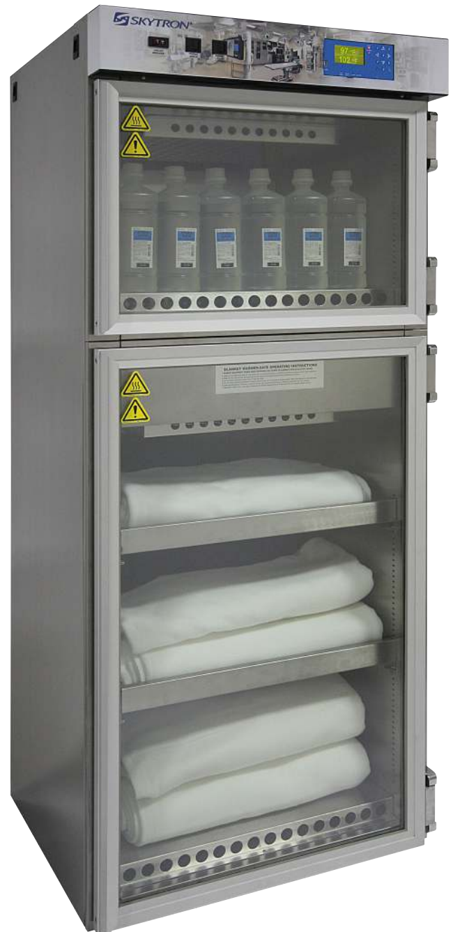
Glass Door Dual Compartment Warming Cabinet (SS2207-J3G)