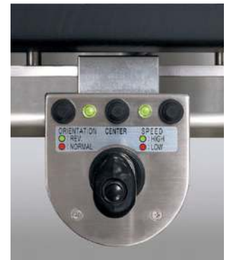
Joy Stick Controller