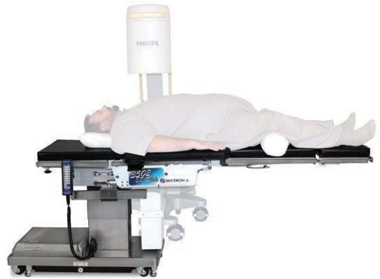
LOWER BODY IMAGING