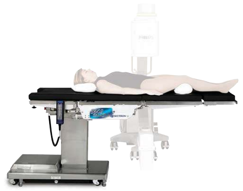
LOWER BODY IMAGING