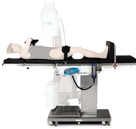
UPPER BODY IMAGING