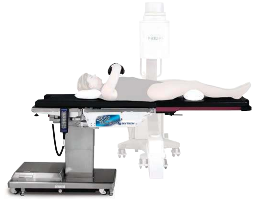
LOWER BODY IMAGING WITH 40" CARBON FIBER EXTENSION