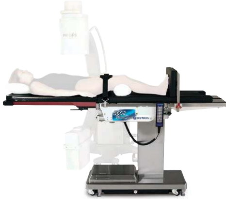
UPPER BODY IMAGING WITH 40" CARBON FIBER EXTENSION