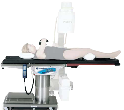
LOWER BODY IMAGING