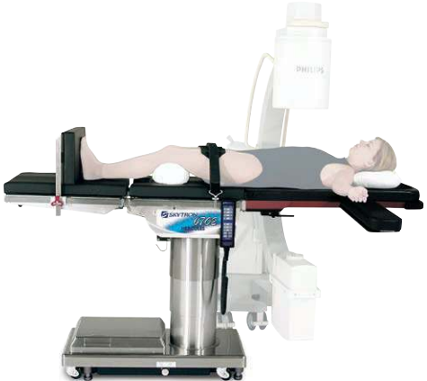
UPPER BODY IMAGING