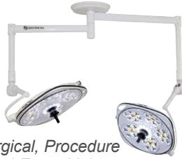
Surgical, Procedure and Exam Lights