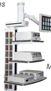
Space Management Booms