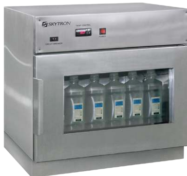
Glass Door SS2201-J2G