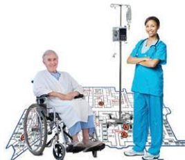
Asset Tracking and Management Systems