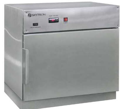
Solid Door SS2201-J2