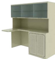
Solid Surface Cabinets