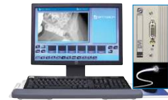
Fully Fiber Optic Digital Integration