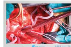
HD Flat Panel Displays

This brochure contains information intended to illustrate a Skytron product. For questions about the availability of Skytron products in your area, contact your Skytron representative. All Skytron products are subject to change without prior notice.