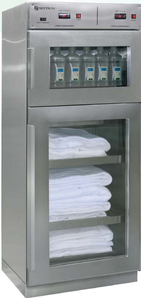
Split Glass Door SS2207-J2G