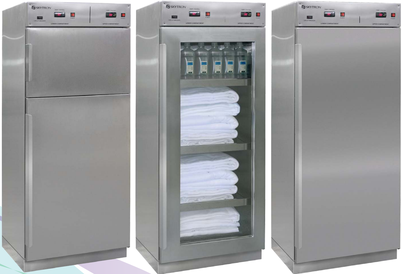
Split Solid Doors SS2207-J2